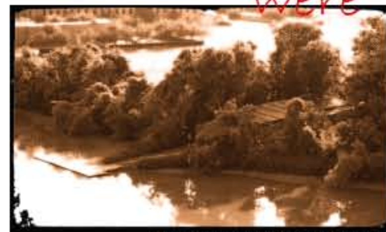
Greater Houston Rowing Club, Oyster Creek 1988-2009